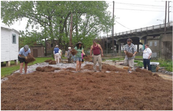
Plowing and mulching day prepared the veggie garden for spring planting.