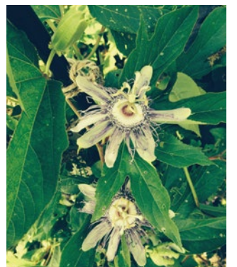
Passion Flower or May Pop.