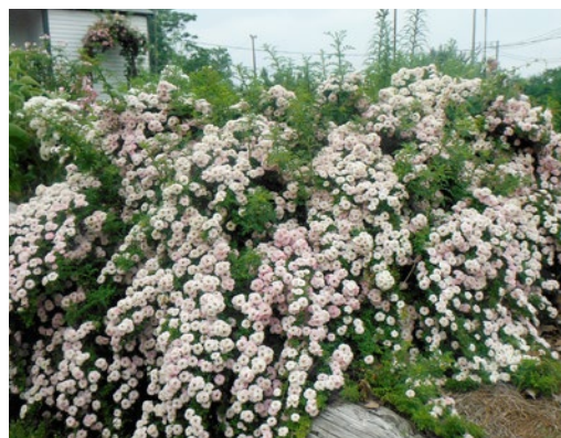
A cascade of Petit Scotch Roses.