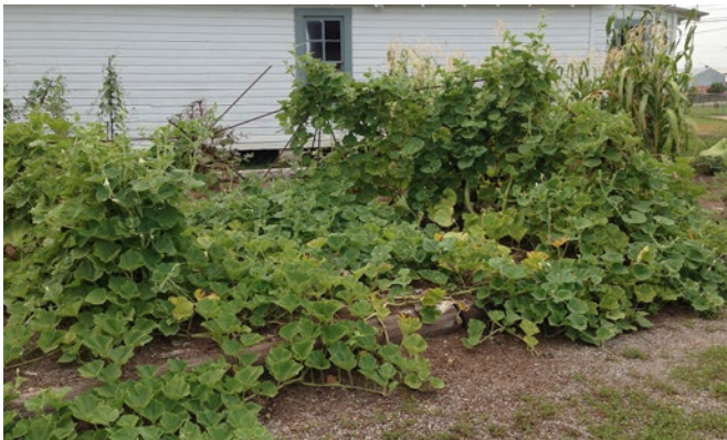
Corn, okra, and the Italian specialty gogootz or snake gourd.