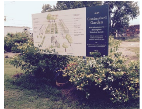
Louise McPhillips illustrated Sloss Quarters surrounding our garden rooms planted with roses and perennials, kitchen and medicinal herbs and vegetables.