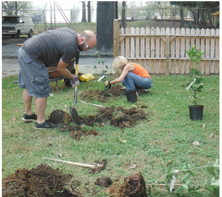
There was some dirt in the side yard for the sweet olive planting.