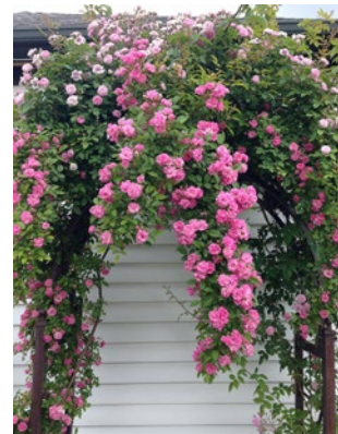
Our Peggy Martin Rose.