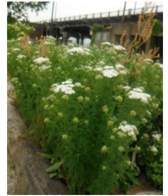
White, medicinal, yarrow.