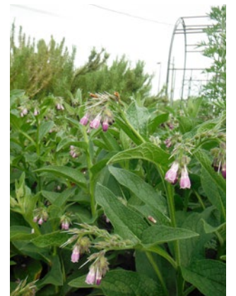
Comfrey and rosemary.