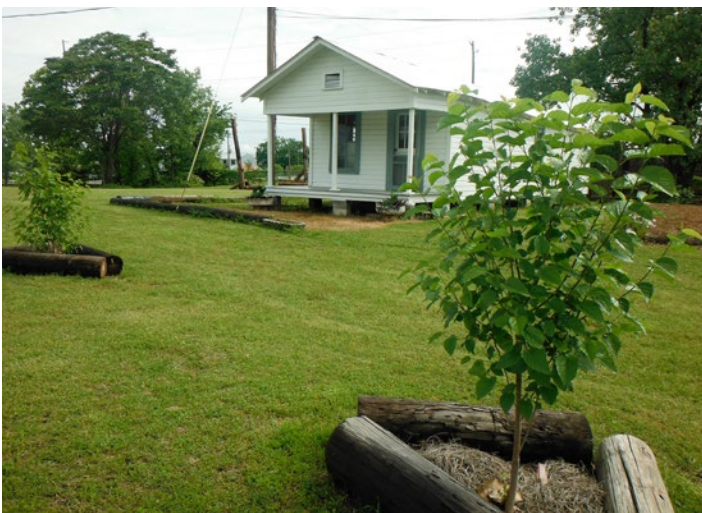
They grew. The shotgun was renovated and its swept-dirt yard planned.