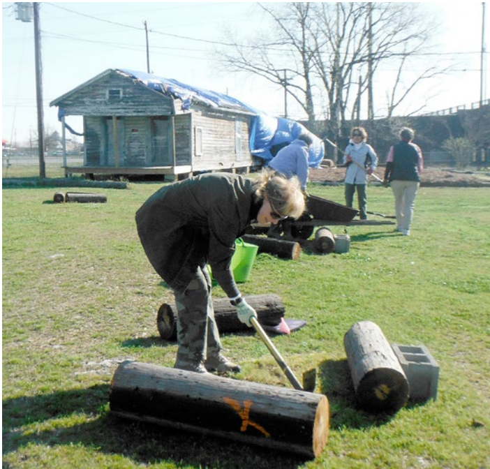
To define the garden entrance, a mulberry row in the former slag pile was planted.