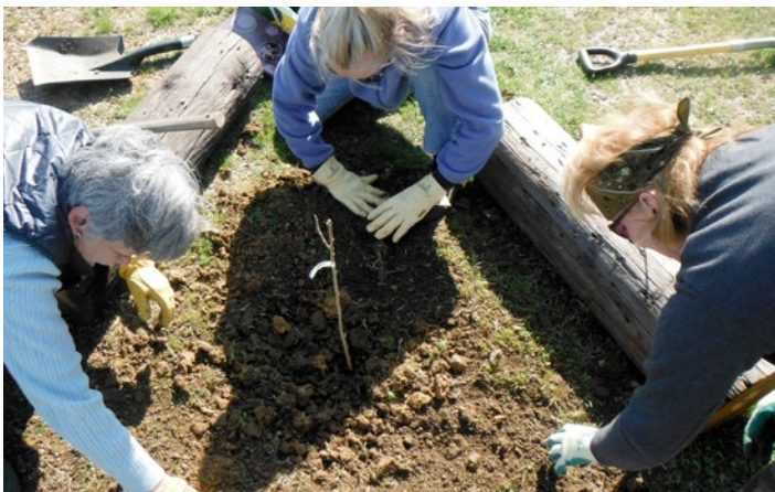
Pick axes and a few prayers accompanied the planting of the seedlings.