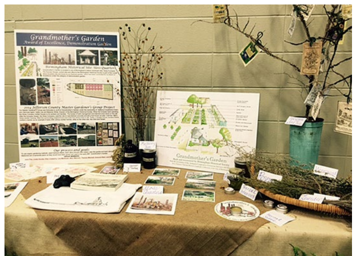
Our master gardeners won a statewide award of excellence for their work.