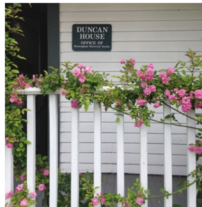
The "Katrina Survivor" rose on the back porch rail.