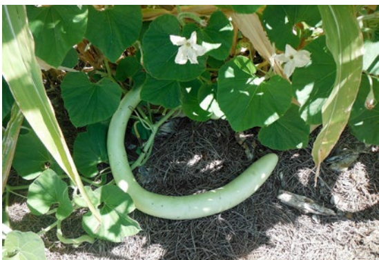
To eat snake gourds, harvest when less than two-feet long.