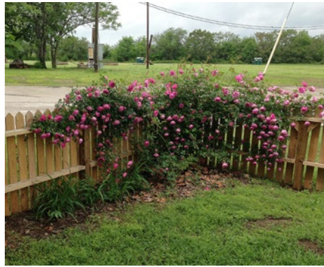
American Beauty Roses on the front fence.