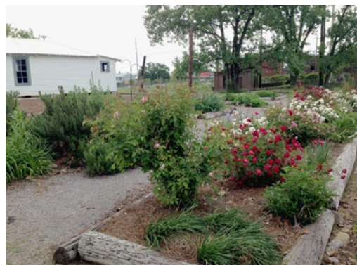
Medicinal herbs, left; roses and perennials, right.