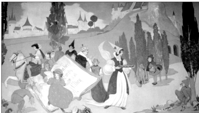
Storybook mural, East Lake Library, 1937.

If you have materials relating to Birmingham history that you would like to give, call Jim Baggett at Archives, 226-3661.