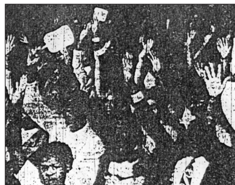
"HANDS UP IN VOTE TO SET UP NEGRO RIGHTS ORGANIZATION . . . Movement born with cheers of 1,000 Negroes in packed church here." The Birmingham News , June 6, 1956, page 11.

"As free and independent citizens of the United States of America and of the State of Alabama, we express publicly our determination to press persistently for freedom and democracy and the removal from our society any forms of second class citizenship."