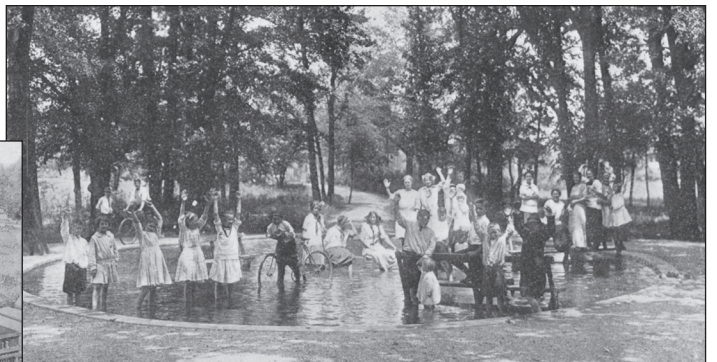
Children frolicking in a Fairfield park wading pool. (Every Fairfield home was within a two-minute walk of a park or parkway).