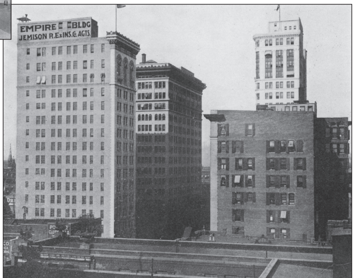
Right: Heaviest Corner on Earth—View of Birmingham Skyline, 1913—The newly completed office buildings at First Avenue and Twentieth Streets (Woodward, Brown-Marx, Empire and American Trust buildings).

The Jemison Magazine and The Selling of Birmingham, 1910-1914 – the 2011 Birmingham Historical Society membership publication has been edited by Julius Linn Jr., Katherine Tipton, and Marjorie White. Its 288 pages are filled with more than 200 black-and-white photographs and drawings. Members may pick up their complimentary copy at the October 9th party at the Jemison-Hamby House, 4100 Crescent Road in Forest Park from four to six. Those member copies not picked up will be mailed the week of October 10-14. Additional copies will be available for sale for $35 postpaid. Send a check to Birmingham Historical Society, One Sloss Quarters, Birmingham, AL 35222, www.bhistorical.org .