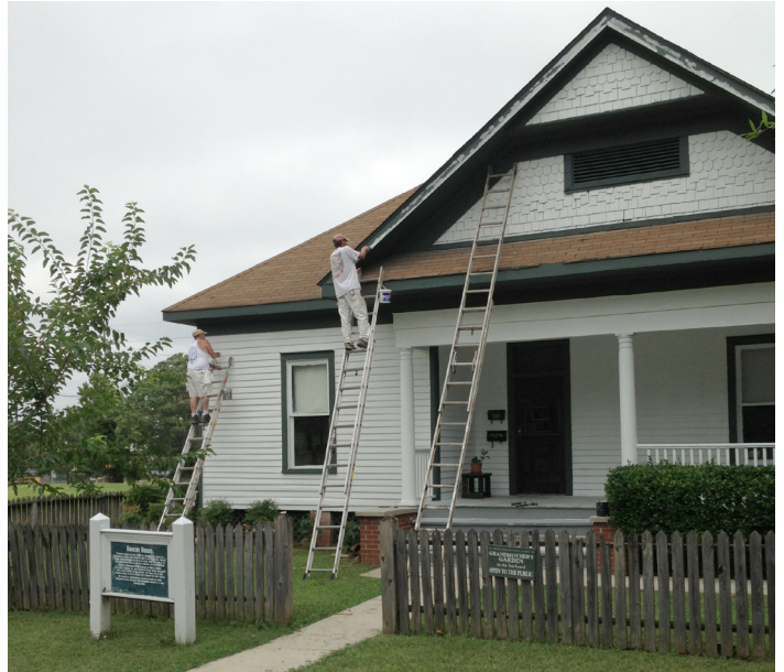
T.C. Roll & Son at work on Duncan House.