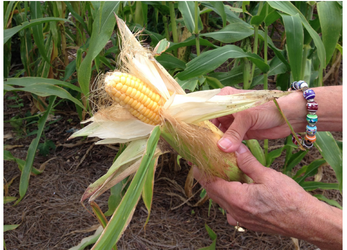
Open-pollinated, non-hybridized, heirloom corn is a visitor favorite at the Society's garden at Sloss. It is chewy, tasty, and also pops. Even the unpopped kernels are edible.

Wednesday mornings find not only gardeners at work, but also plein air painters capturing the garden's industrial setting and fleeting blooms. Sumter Coleman is rallying artists, but all are welcome. Please join us in the beautiful autumn light.