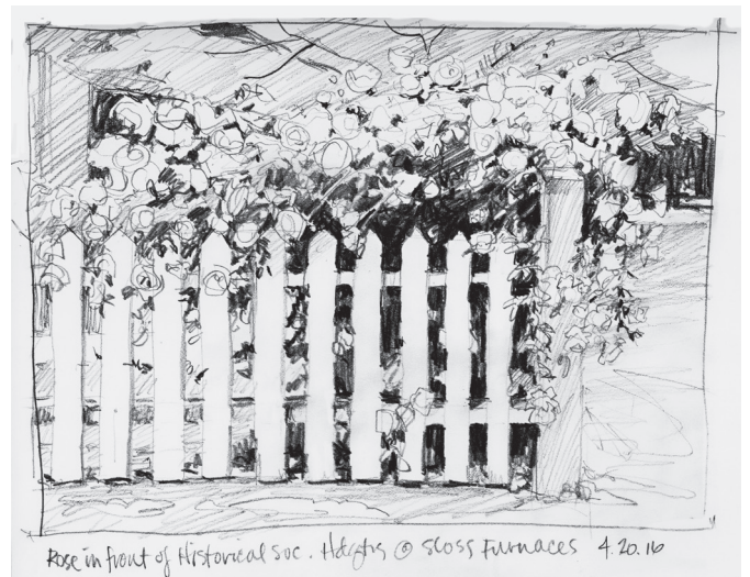
Gail Cosby also captured the roses on our front fence.