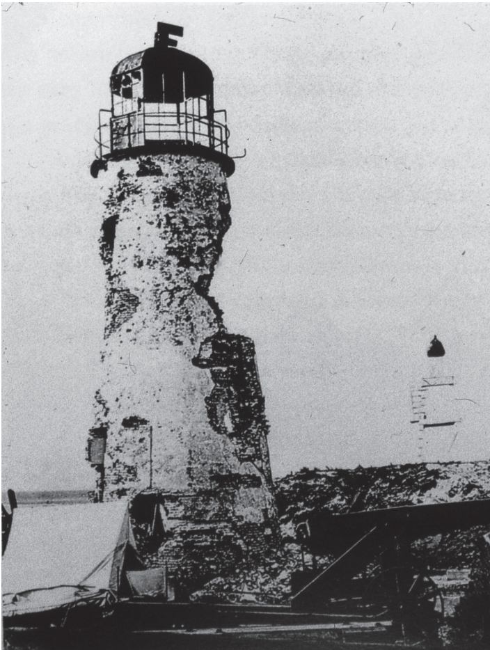
Mobile Point Lighthouse, 1864. Moses and Piffet made this photograph of the heavily damaged beacon following the Battle of Mobile Bay.

See the Heirloom Cake Competition Information and think seriously about entering—entry form on Page 4.