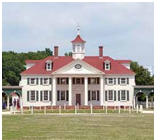
Washington Hall (1999), American Village, Montevallo.

Items in the Harrison collection encompass paintings, letters, furniture, porcelain, coin silver utensils, jewelry, and busts, as well as Martha Washington's 1783 prayer book, her tea pot and writing instruments, a 1787 sketch of the Mount Vernon grounds, a letter to President James Madison, and the correspondence of a British general defeated at Yorktown. At American Village, the collection of Washington family heirlooms will be housed in a specially built expansion of Independence Hall.