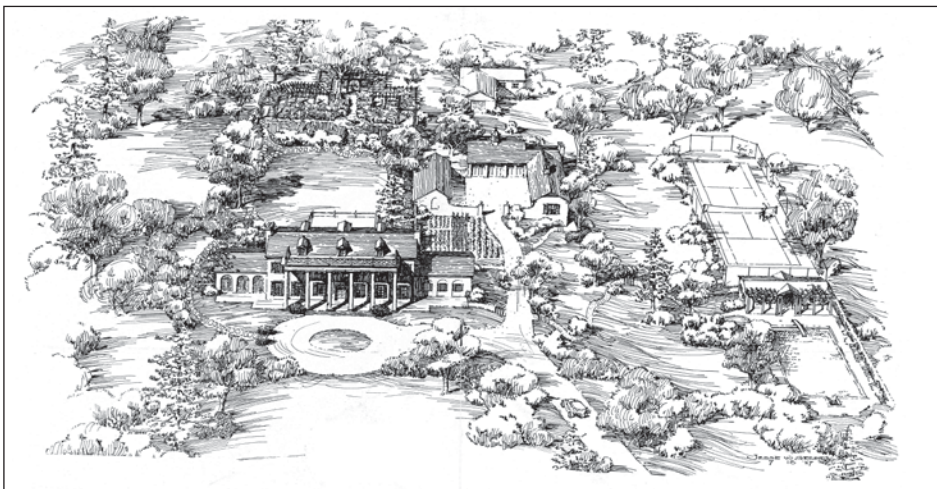
Mountain Brook's Model Country Estate (1927). Drawing by Jesse W. Green, July 18, 1927, The Jemison Magazine , September 1927, BPL Archives.

Brandt notes that not only the wealthy were building these copies of Mount Vernon. By 1932, anyone could order a pre-fabricated version of the first family's home through the Sears Roebuck & Company catalogue. The home's famed columned piazza built to overlook the Potomac was replicated in not only houses, but motels, banks, restaurants, college and exposition buildings, and funeral homes. Brandt's digital map of Mount Vernon replicas across the United States is found at https://www.mountvernon.org/library/digitalhistory/past-projects/is-that-mount-vernon .