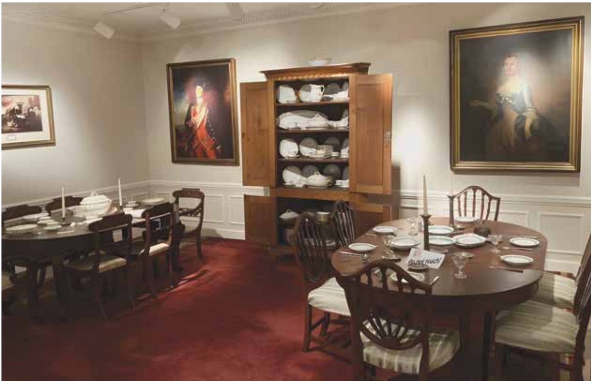
Washington family furnishings, portraits, china, and silver at the Karl C. Harrison Museum of George Washington in Columbiana, Shelby County. They are soon to be on permanent exhibit at American Village.